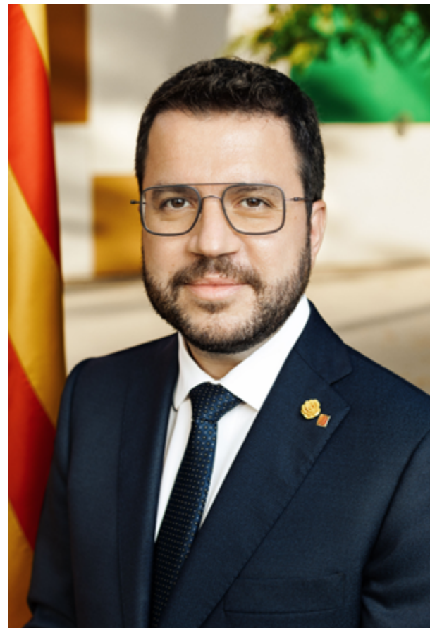
Pere Aragonès i Garcia President de la Generalitat de Catalunya

Catalonia is one of the regions in Europe with the greatest diversity of landscape. It is this wealth of natural heritage that, along with the country's own history and the values of integration, plurality, endeavour, entrepreneurship and hospitality, define Catalonia, creating a mosaic of gastronomy admired throughout Europe.